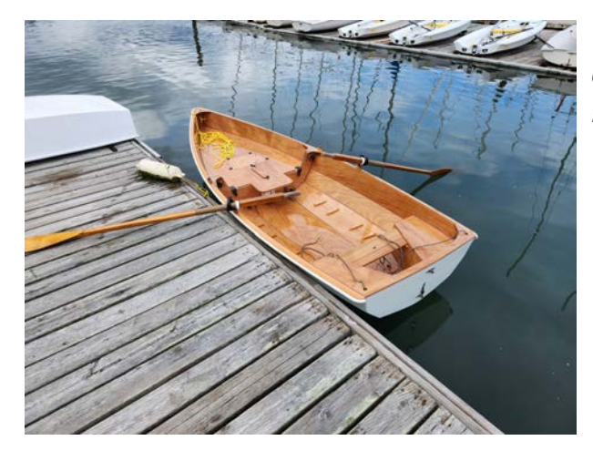
Greg's two-piece tender, assembled ready for rowing.