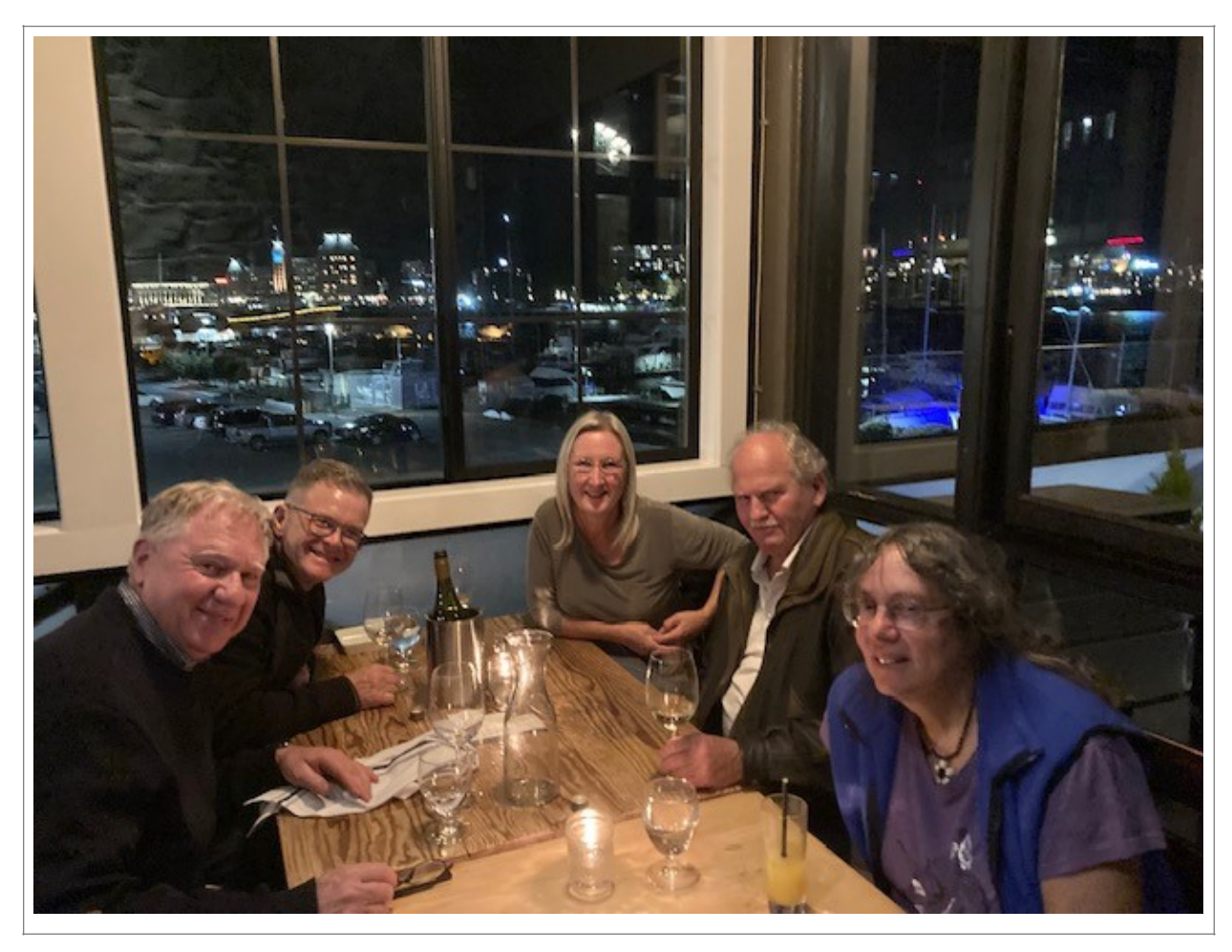
Wonderful dinner at Finns!

After our tour, we had a few hours of free time in Victoria before getting together for drinks, then dinner at Finns on the waterfront. The company, food, and beverages were excellent and all had a good time.